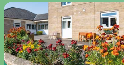
Burnworthy House South Petherton

Our specialist dementia teams provide a safe, secure and stimulating environment to help you to live well with dementia.