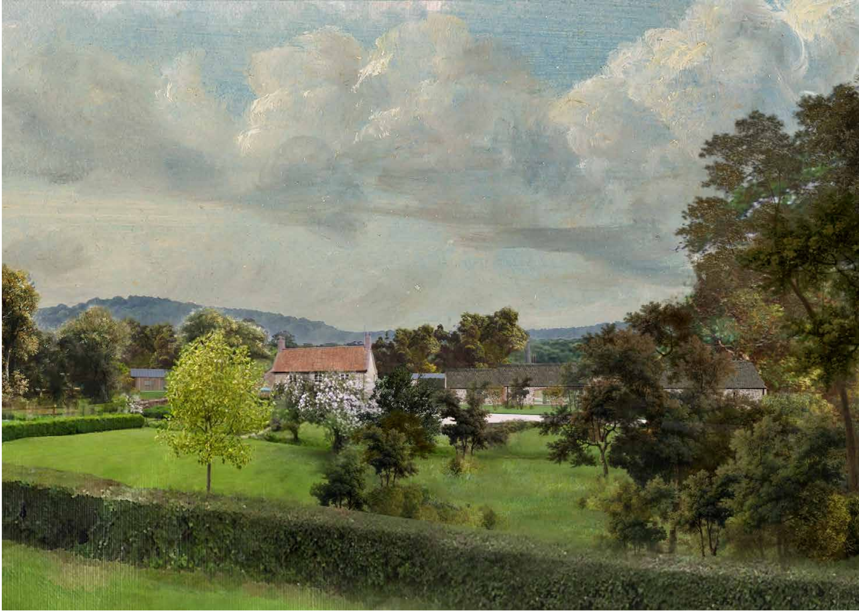
VIEWPOINT B - PROPOSED ILLUSTRATIVE VIEW