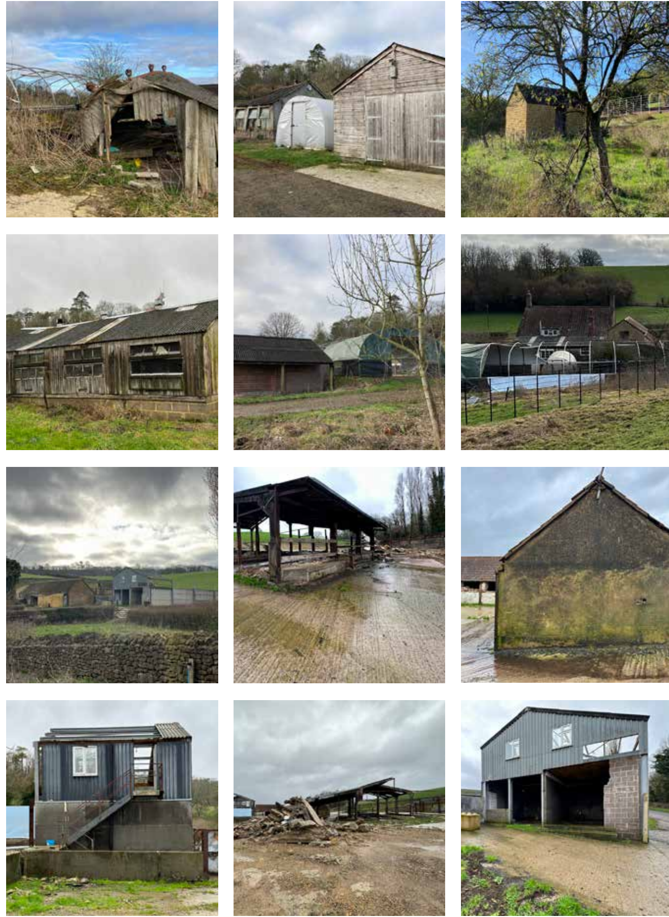
EXISTING SITE CHARACTER