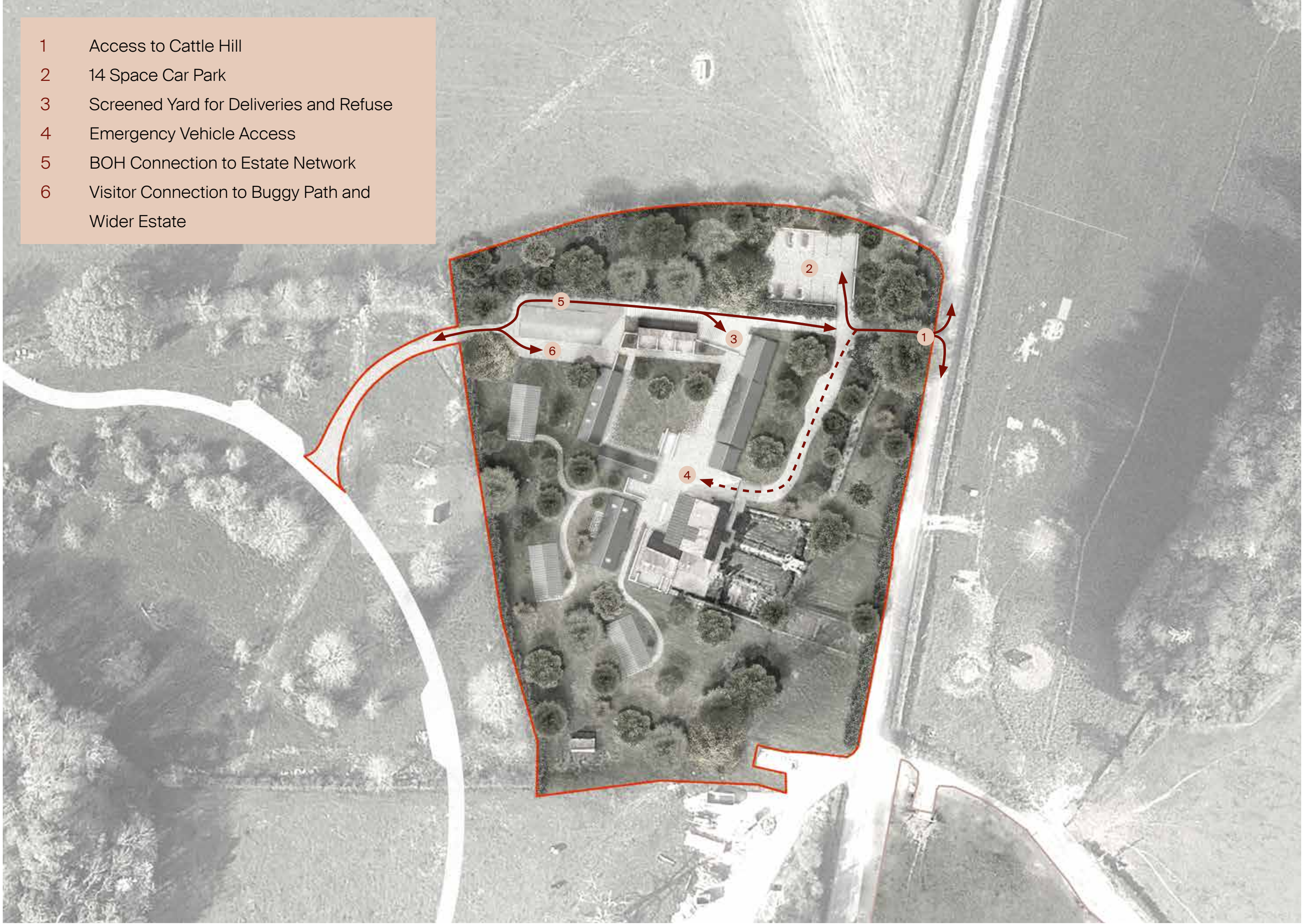
ACCESS & SERVICING