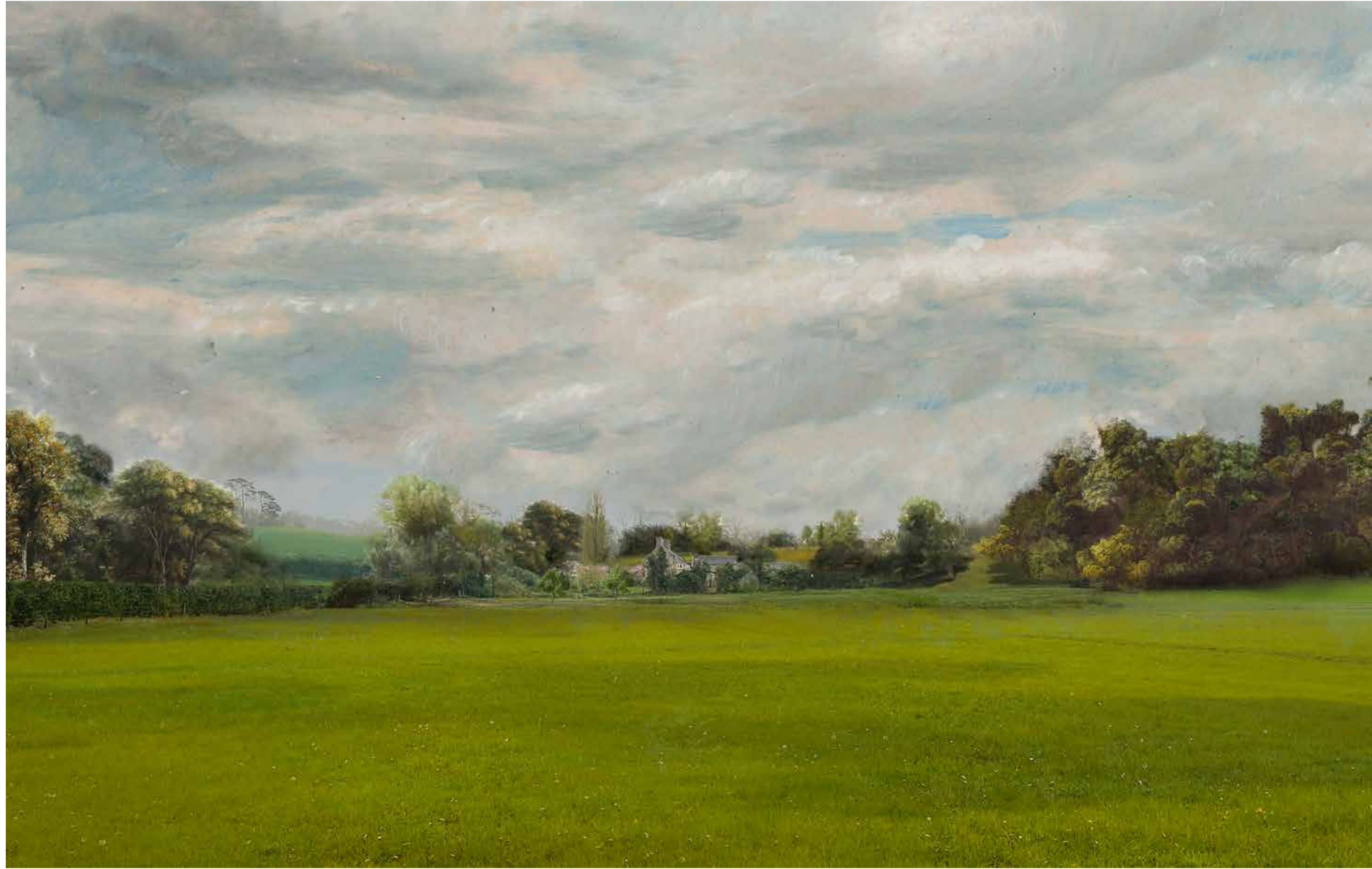
VIEWPOINT A - EXISTING ILLUSTRATIVE VIEW