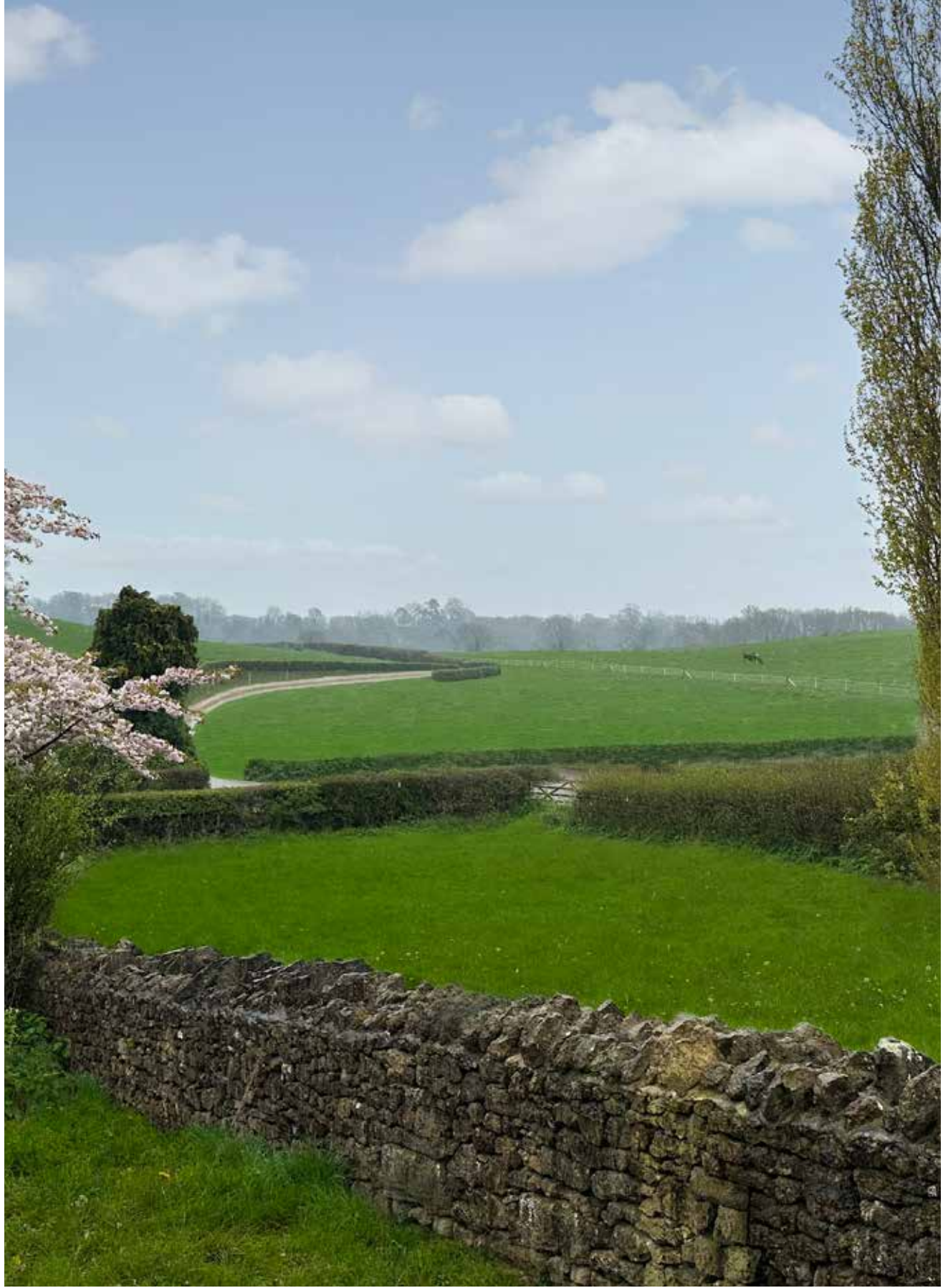
VIEWPOINT C - PROPOSED ILLUSTRATIVE VIEW