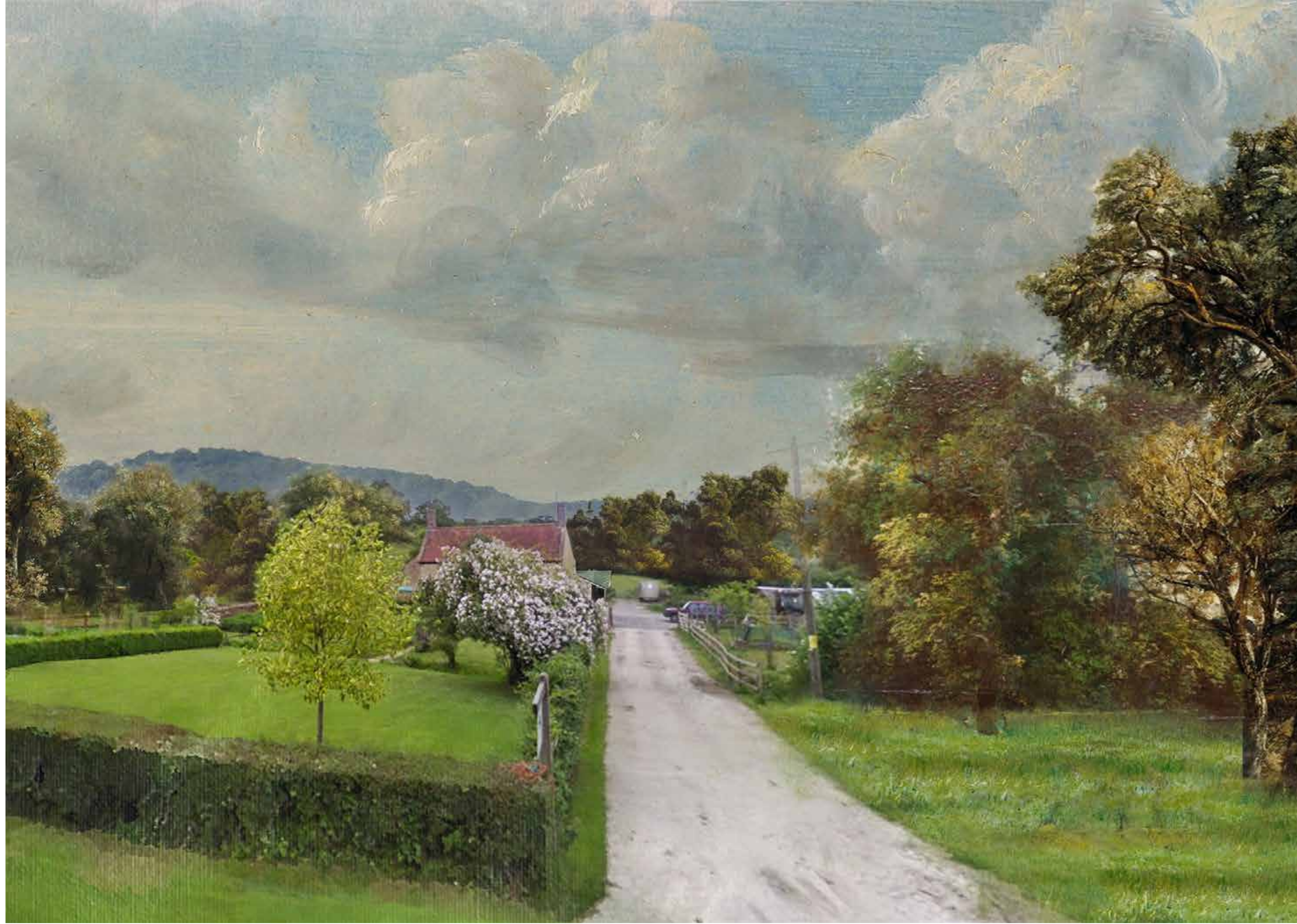
VIEWPOINT B - EXISTING ILLUSTRATIVE VIEW