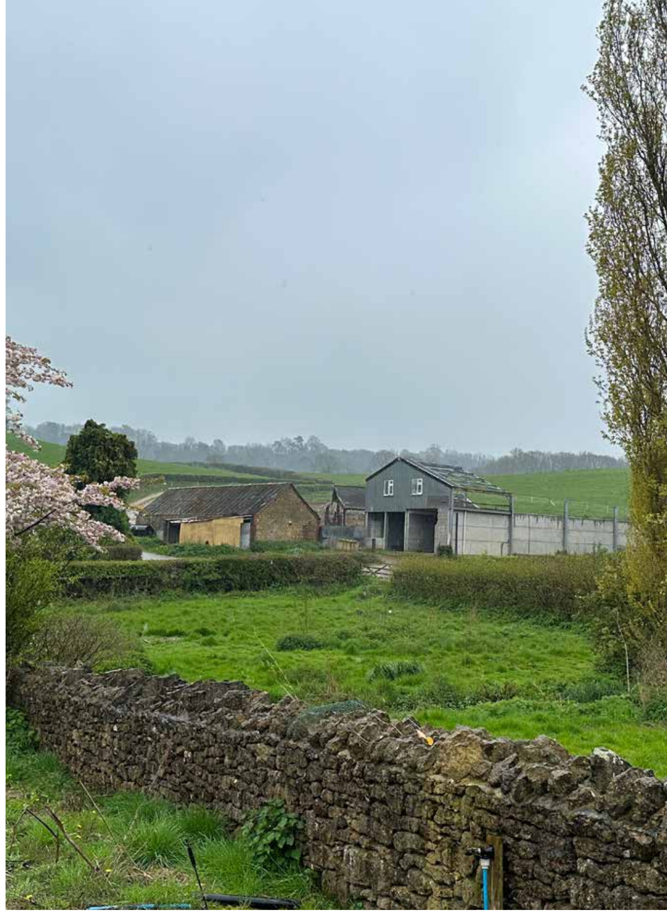
VIEWPOINT C - EXISTING ILLUSTRATIVE VIEW